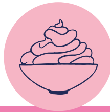
Goal 1: Creamy

Work with your rōpū to investigate these goals and how they might help with your ice cream.