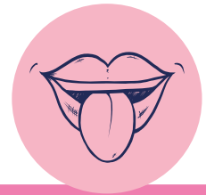
Goal 3: Flavourful